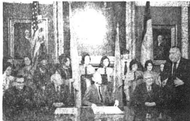
Commissioner Angier Biddle Duke signs the Ukrainian Independence Day proclamation before representatives of the Ukrainian community.