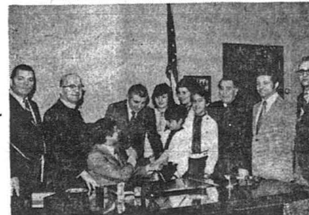
Mayor Lee Alexander signs the 1975 Ukrainian Independence Day proclamation before local community leaders.