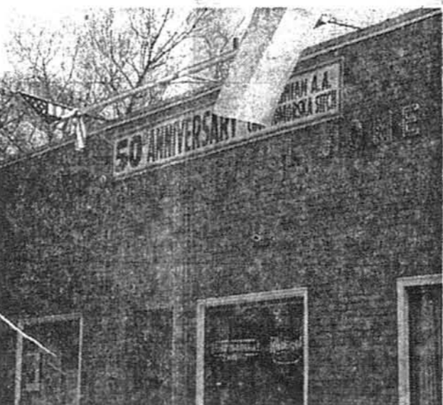
Newark "Sitch" Clubhouse adorned with American and Ukrainian flags.