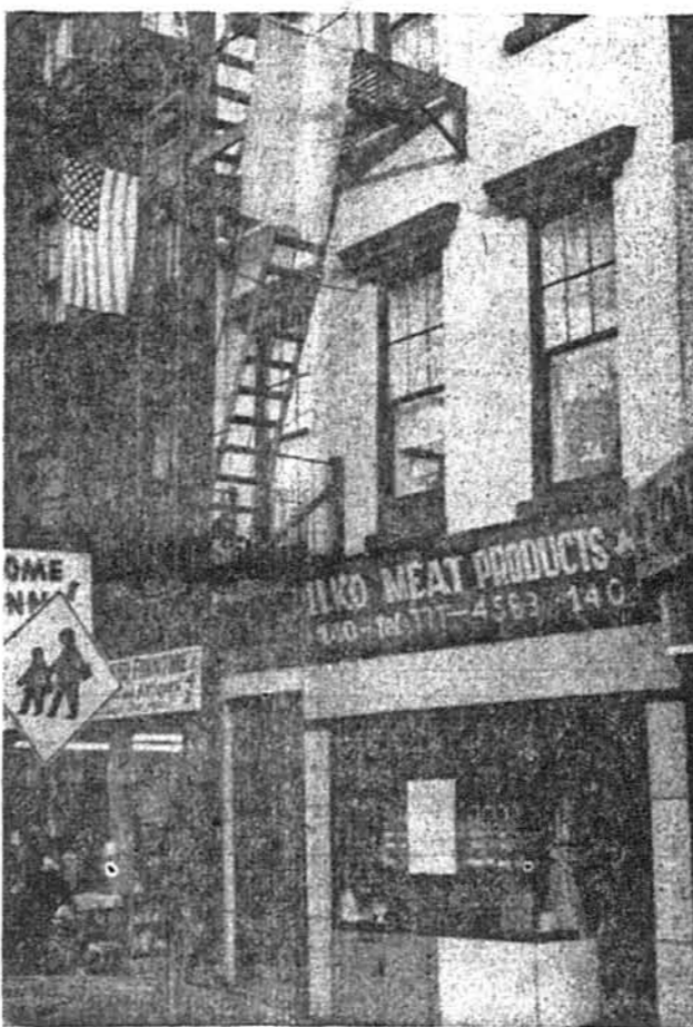
Ilko Meat Market in New York, N.Y.