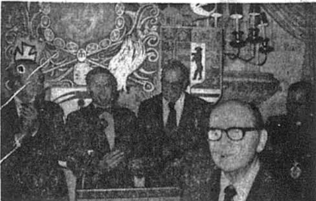
Lt. Gov. T. Hartigen attending a Ukrainian Independence Day banquet in Chicago, Ill., where he read the Ukrainian Independence Day proclamation.