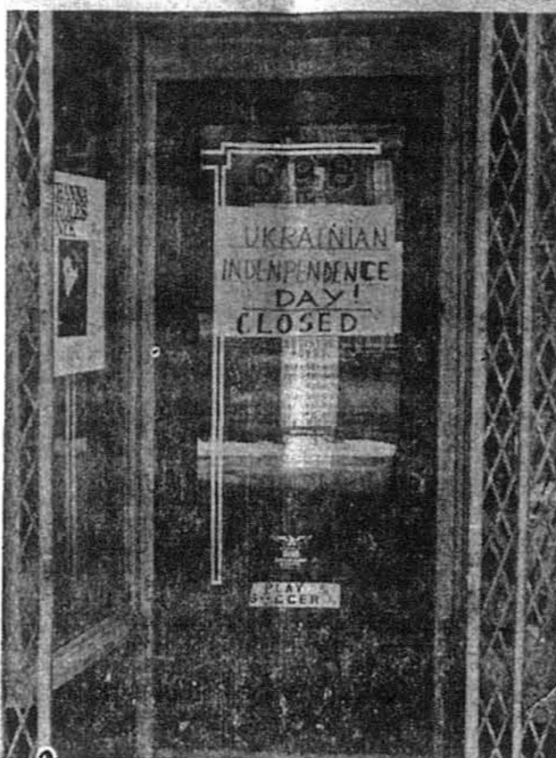
"Dnipro" Store in Newark, N.J.