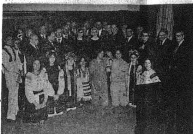
Ukrainian Philadelphians join with Mayor Frank L. Rizzo for the signing of the annual Ukrainian Independence Day proclamation.