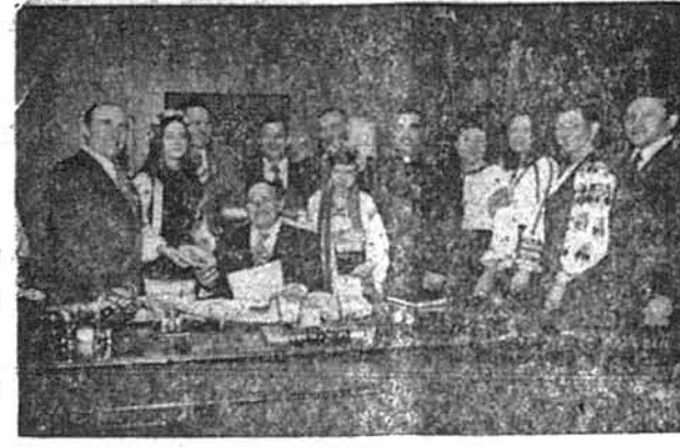
Mayor Nicholas Pannuzio issues the 1975 Ukrainian Independence Day proclamation.