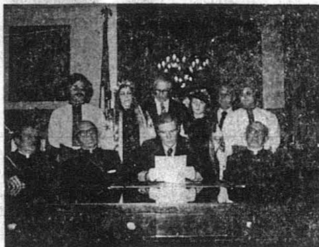
Garden State Ukrainian leaders witness Gov. Brendan T. Byrne signing the Ukrainian Independence Day proclamation.