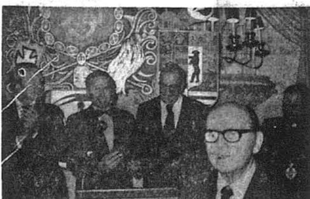
Lt. Gov. T. Hartigen attending a Ukrainian Independence Day Banquet in Chicago, Ill., where he read the Ukrainian Independence Day proclamation.