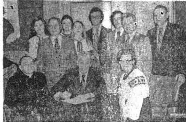
Mayor Bartholomew Guida signs the 1975 Ukrainian Independence Day proclamation.