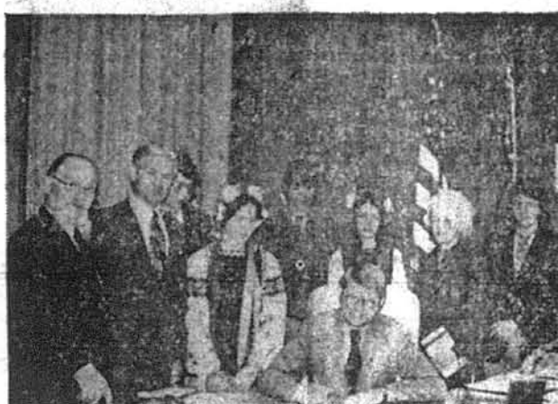
State-wide Ukrainian community activists witness Gov. Richard D. Lamm signing the Ukrainian Independence Day proclamation.