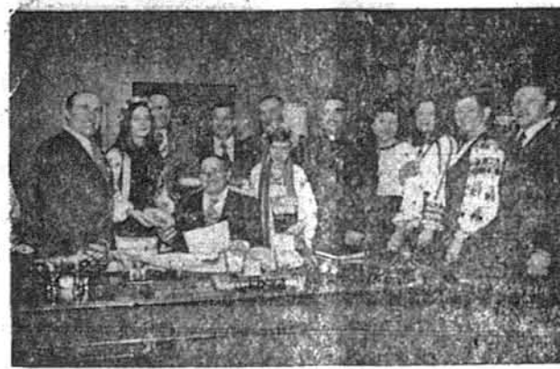
Mayor Nicholas Panuzio issues the 1975 Ukrainian Independence Day proclamation.