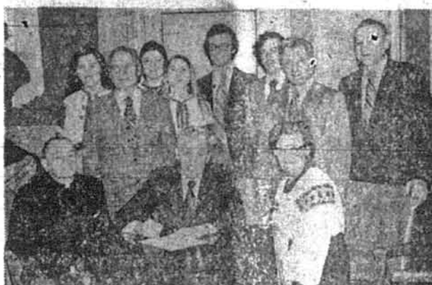
Mayor Bartholomew Guida signs the 1975 Ukrainian Independence Day proclamation.