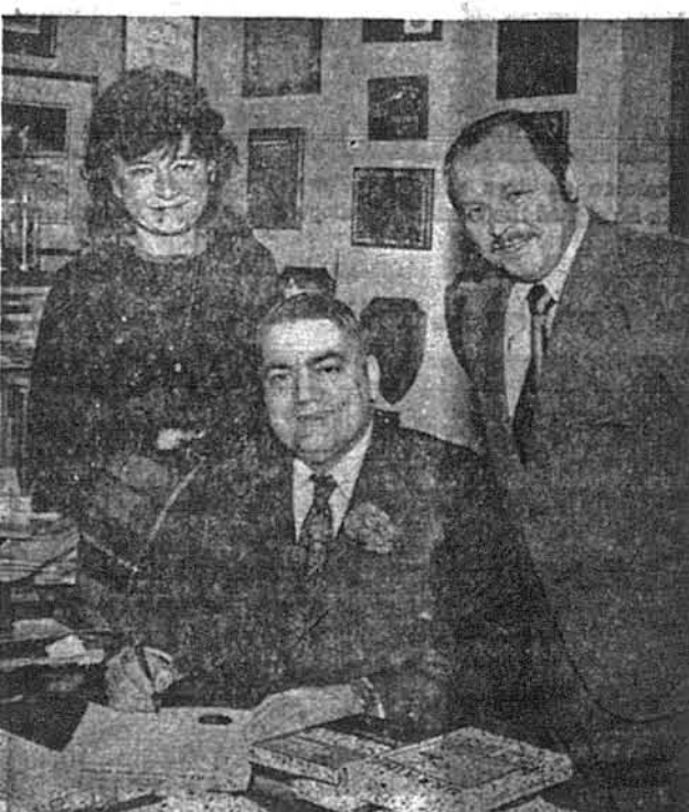
Mayor George Atenson signs the Ukrainian Independence Day proclamation in the presence of local Ukrainian residents.