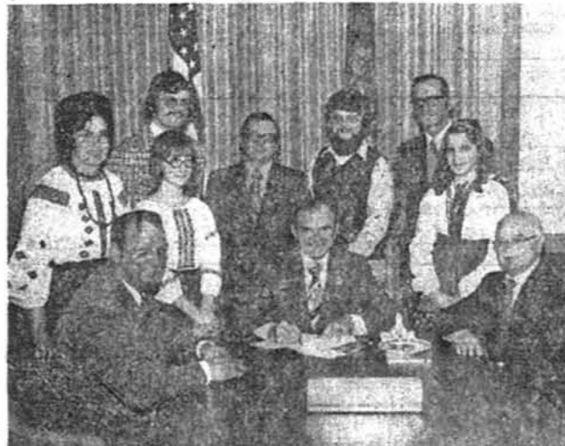
Gov. Arthur A. Link issues the Ukrainian Independence Day proclamation.