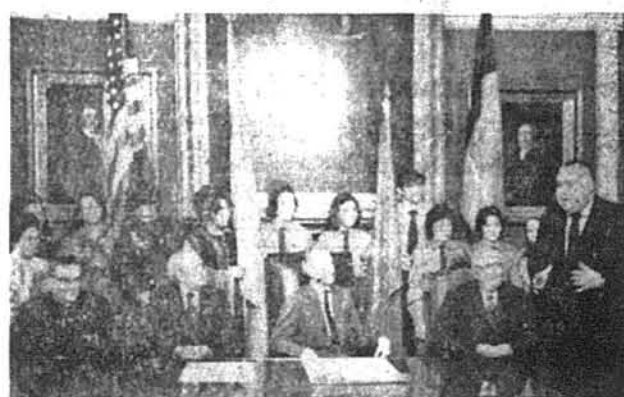
Commissioner Angier Biddle Duke signs the Ukrainian Independence Day proclamation before representatives of the Ukrainian community.