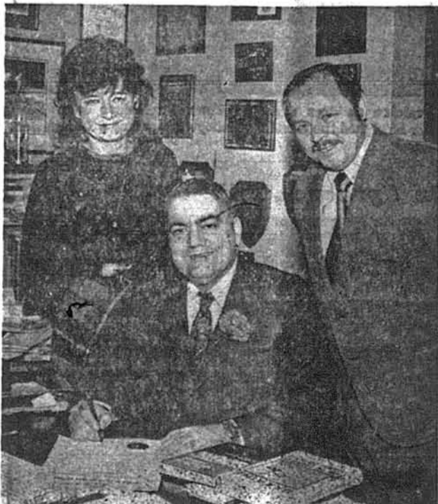
Mayor George Atenson signs the Ukrainian Independence Day proclamation in the presence of local Ukrainian residents.