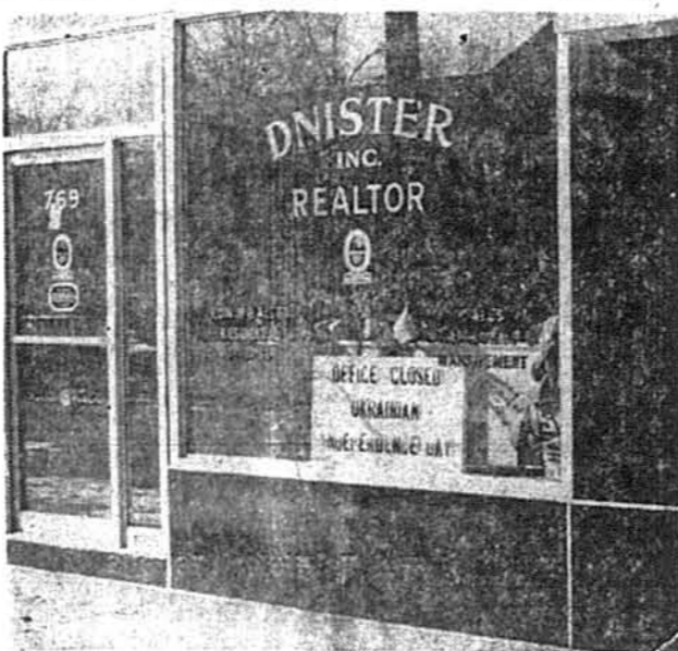
Dnister Realty in Newark, N.J.