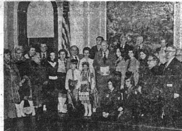
Members of the Ukrainian community pose with Mayor Robert Grassmere and town council members for the signing of the Ukrainian Independence Day proclamation.