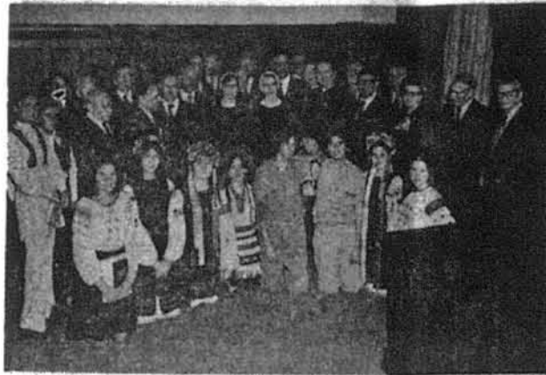
Ukrainian Philadelphians join with Mayor Frank L. Rizzo for the signing of the annual Ukrainian Independence Day proclamation.