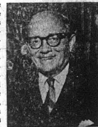
Dr. Lev E. Dobriansky

The annual observance of Ukrainian Independence Day on January 22nd is not just a need; it is a perennial necessity. A necessity arising from our American devotion and dedication to the basic and fundamental principles of national independence and self-determination, to the unalienable rights of man, and to our human concern for the plight of others who are denied the freedom we enjoy both as a Nation and as individual persons. Indeed, especially as regards Ukraine, the largest captive non-Russian nation both within the Soviet Union and in Eastern Europe, the observance is a necessary reminder to our fellow Americans in terms of our own national security which is being progressively threatened by the steady military build-up of Moscow and its KGB activities throughout the Free World.